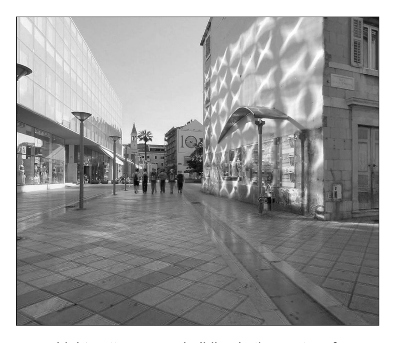
Light patterns on a building in the centre of Split, Croatia