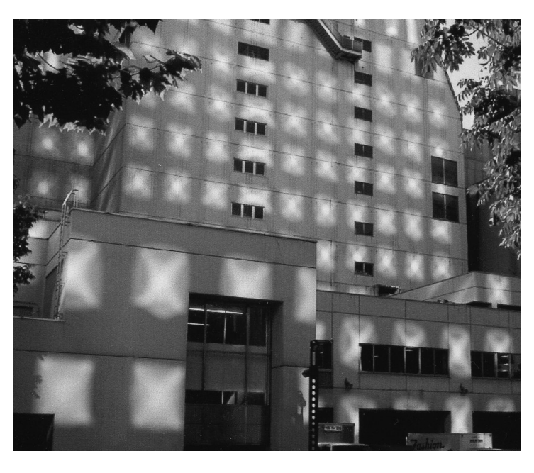
Light patterns on Tokyu Department Store in Sapporo, Hokkaido, Japan